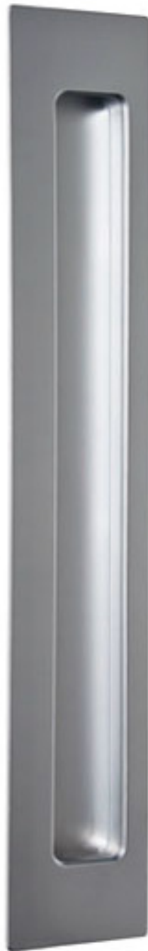
Right Hand Pull shown above