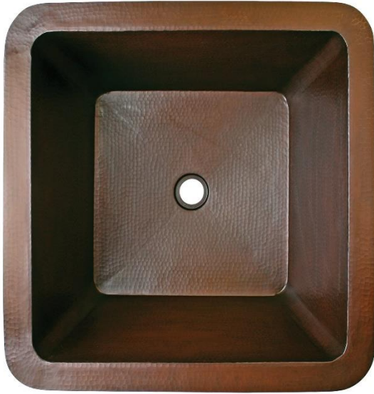
Shown in DB