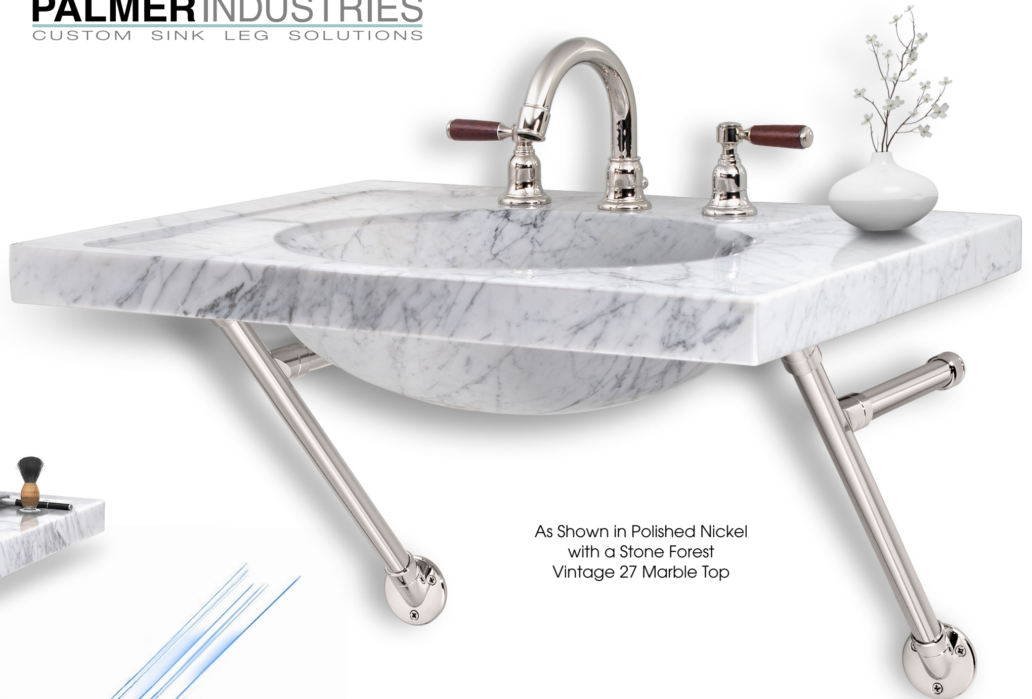
As Shown in Polished Nickel with a Stone Forest Vintage 27 Marble Top