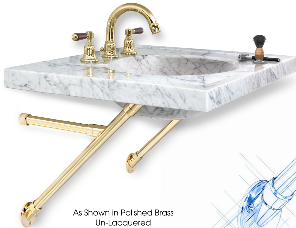
As Shown in Polished Brass Un-Lacquered